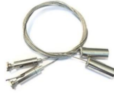
Steel Wire Suspension Kit